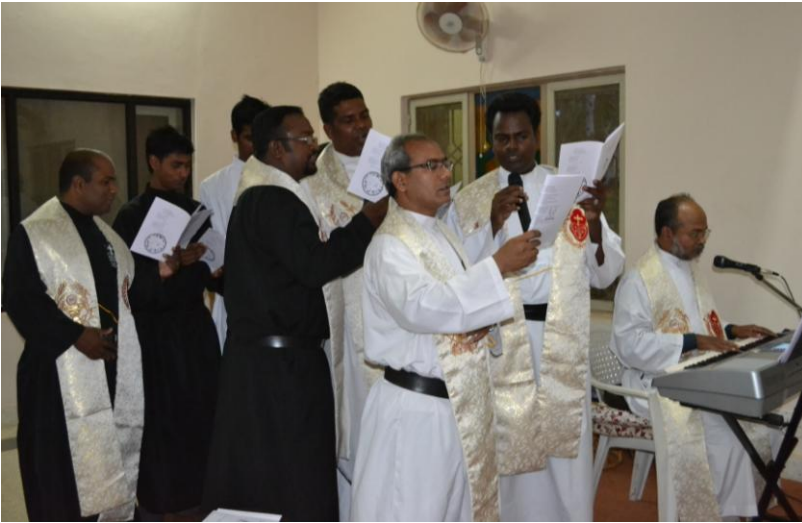
Some of the men formed a choir to cantor all the songs for prayer services and Eucharists during the five days of the Congress.