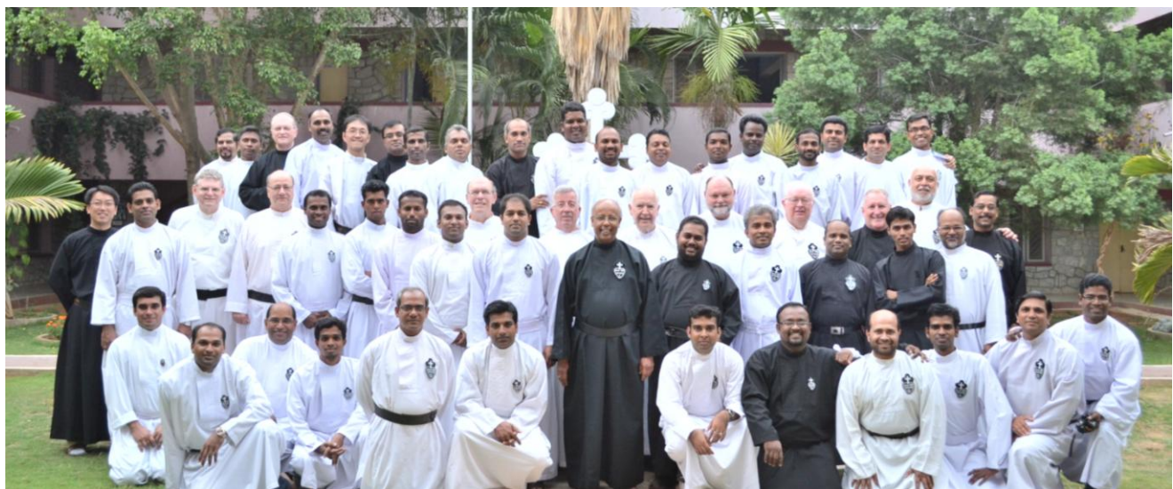
Delegates and guests gather in retreat center courtyard for official Congress photo.