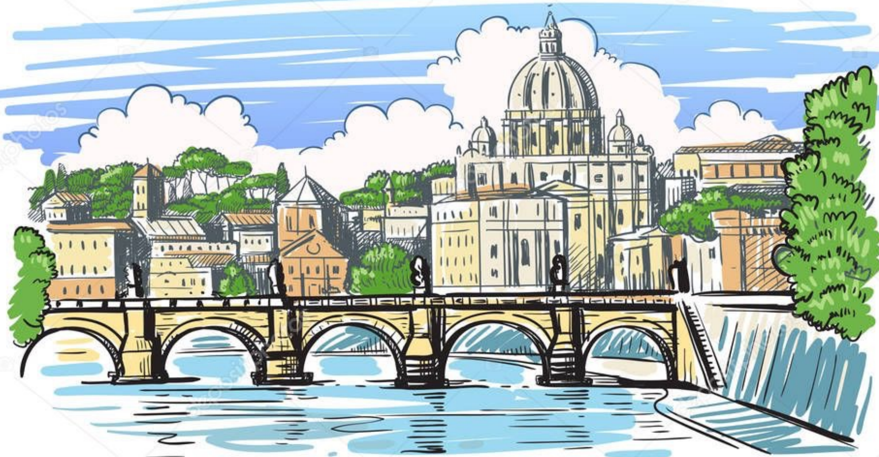
Pont San' Angelo, Rome